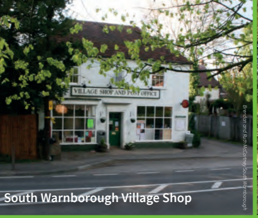
South Warnborough Village Shop