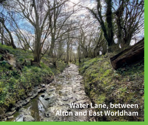
Water Lane, between Alton and East Worldham