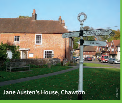
Jane Austen's House, Chawton