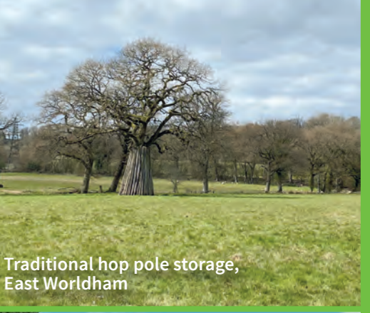
Traditional hop pole storage, East Worldham