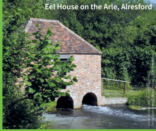
Eel House on the Arle, Alresford