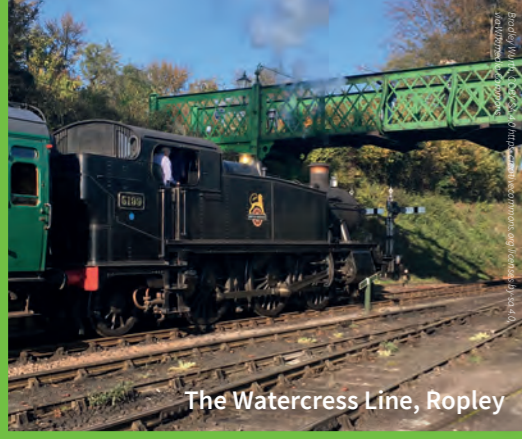
The Watercress Line, Ropley