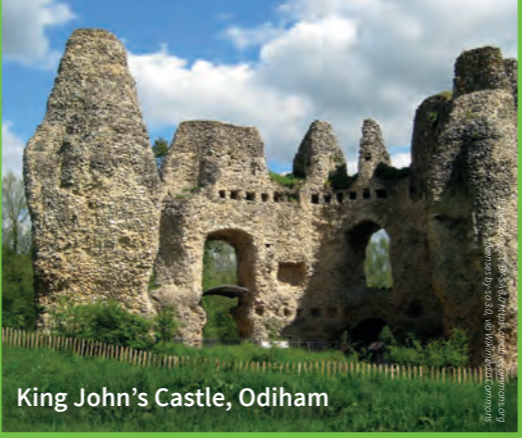
King John's Castle, Odiham