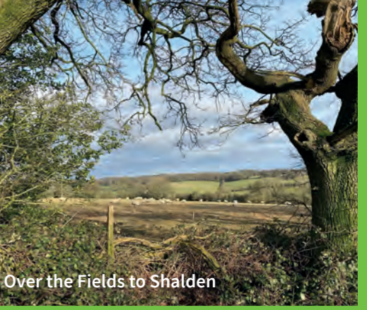
Over the Fields to Shalden