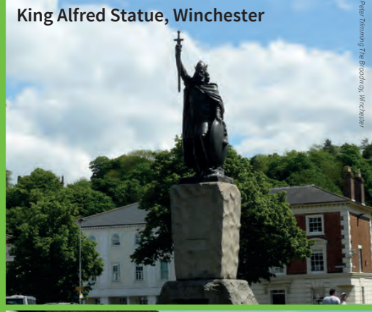
King Alfred Statue, Winchester