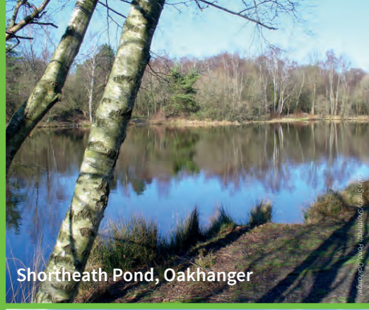
Shortheath Pond, Oakhanger