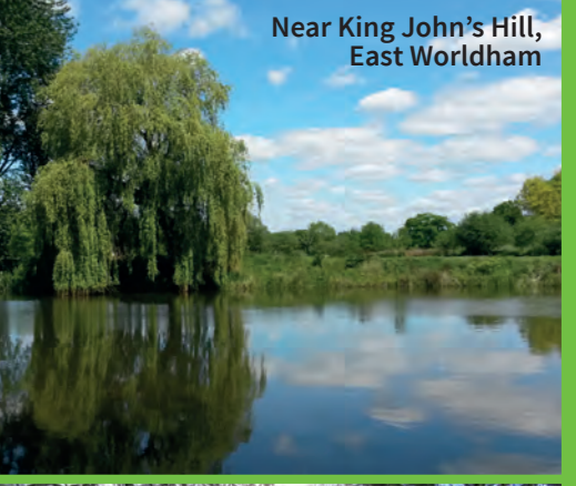
Near King John's Hill, East Worldham