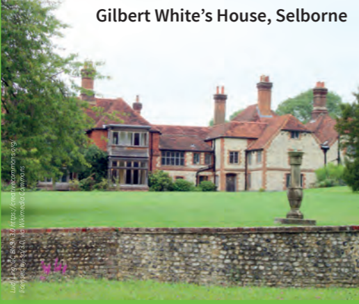
Gilbert White's House, Selborne