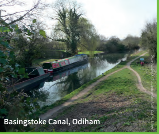
Basingstoke Canal, Odiham