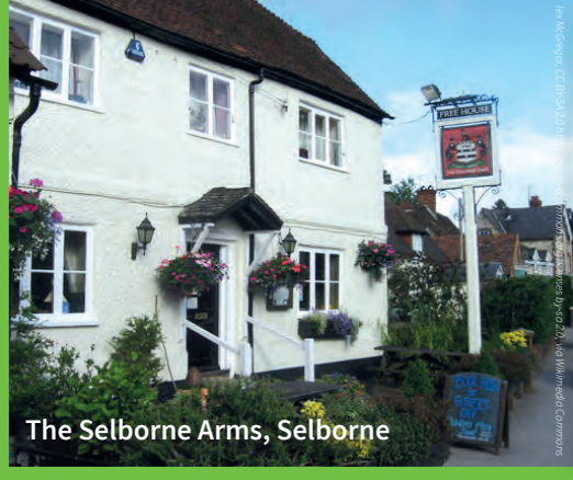
The Selborne Arms, Selborne