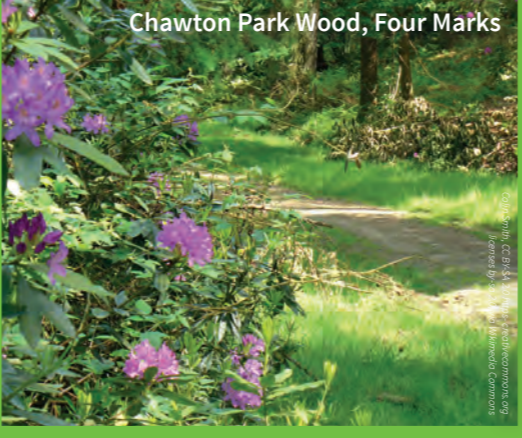
Chawton Park Wood, Four Marks